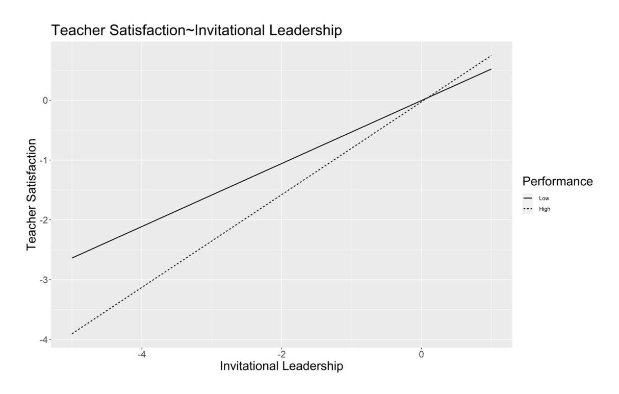
Figure 1. Teacher satisfaction ~ Invitational leadership

Put differently, as principal invitational leadership increased, we found increased amounts of teacher reported satisfaction. This is illustrated in Figure 1 for participants from both low and high-performing schools as the lines representing both groups on teacher satisfaction increase from left to right (i.e., increasing amounts of Invitational Leadership on the x-axis). We did not find a significant difference between school academic performance levels in teacher reported satisfaction (see Table 1). However, this result is difficult to interpret given the significant interaction between invitational leadership and school academic performance level (see Table 1). This significant interaction, illustrated by the intersection of the lines in Figure 1, indicates that the teacher satisfaction-principal invitational relationship is dependent on school academic performance level. More specifically, the teacher satisfaction-principal invitational leadership relationship is stronger in high-performing schools (see the steeper slope of the dotted regression line in Figure 1).